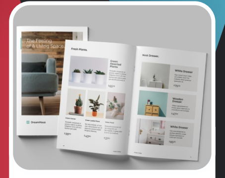
Dépliant and magazines