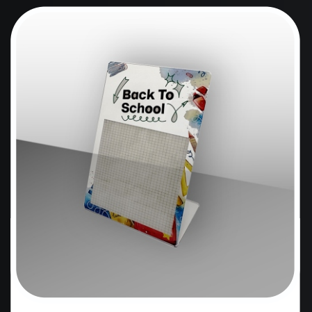
Desk displays in PETG