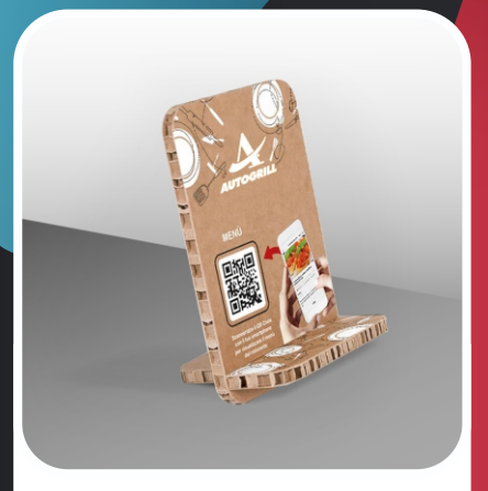
Desk display in reboard