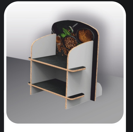
Desk display in reboard