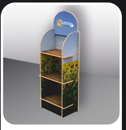
Floor display in reboard