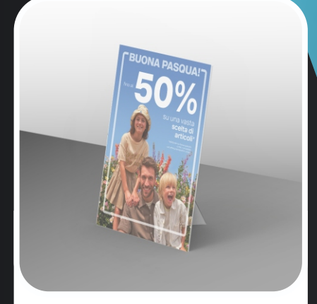
Desk display in cardboard