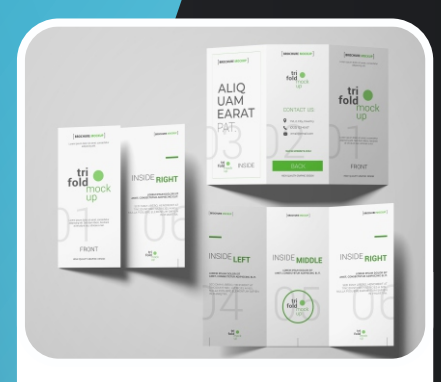
Brocures and flyers