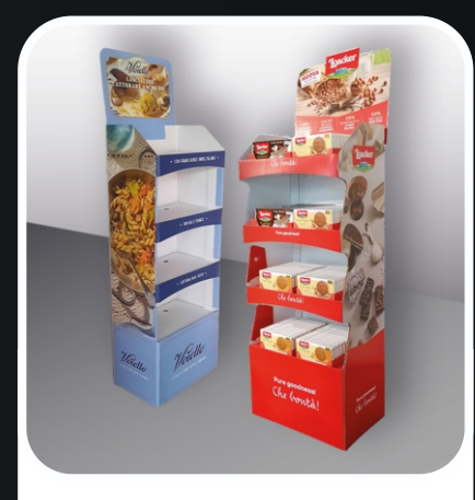
Floor display in cardboard