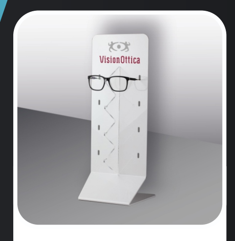
Desk display in plexiglass