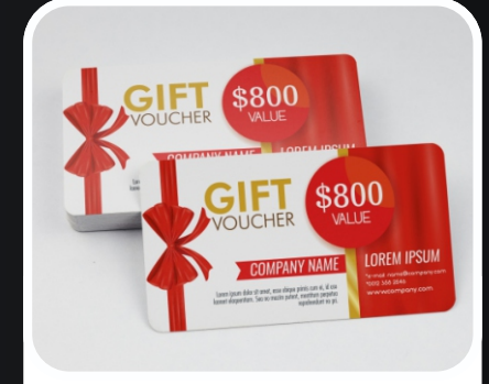
Badge, gift & fidelity card