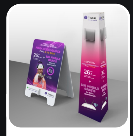
Floor display in corrugated plastic

Floor and desk totem displays made from various materials such as cardboard, PVC forex, reboard, corrugated plastic, plexiglass, sandwich, dibond, PETG, etc. Available in standard sizes or customized to clients' specifications.