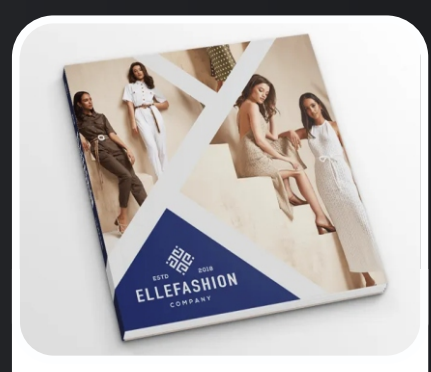
Catalogs and Manuals