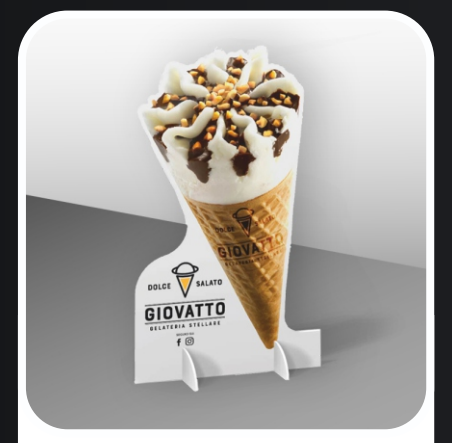
Floor display in sandwich