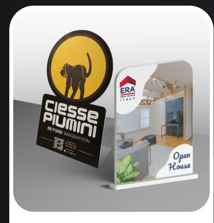
Desk displays in PVC forex