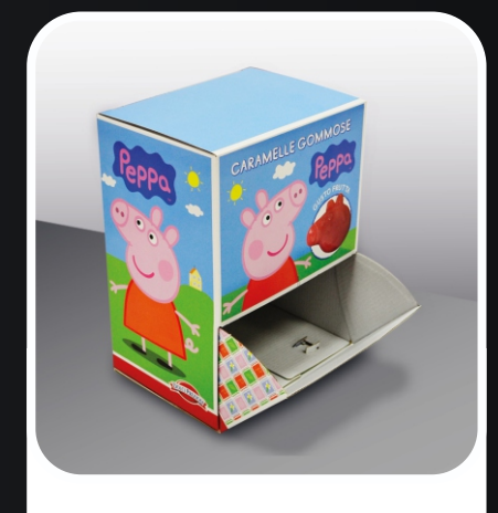
Desk display in cardboard