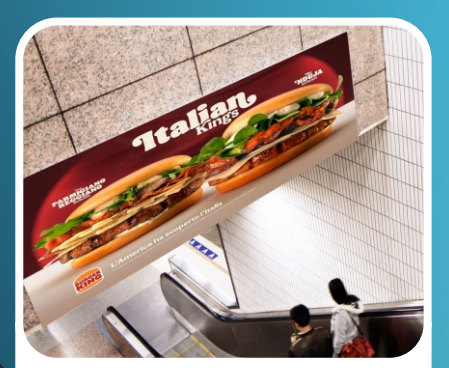
Large format advertising panels

Our printers use UV inks that are highly resistant to weather conditions, and most importantly, are eco-friendly with GreenGuard certification.