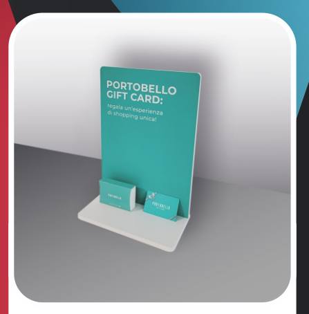
Desk display in PVC forex