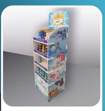
Floor display in PVC forex

Floor standing and desk displays for products. Made from various materials such as cardboard, PVC forex, reboard, corrugated plastic, plexiglass, sandwich etc. Available in standard sizes or customized to clients' specifications.