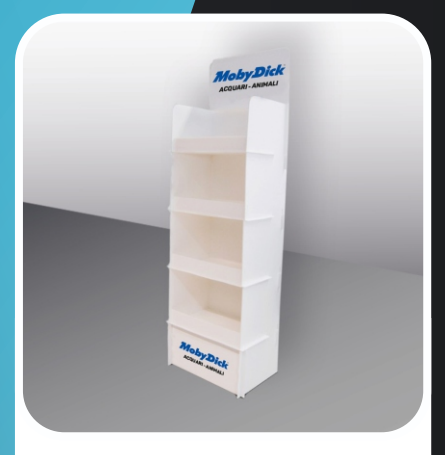
Floor display in plexiglass