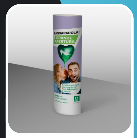
Floor display in cardboard