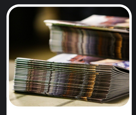
Mass retail leaflets