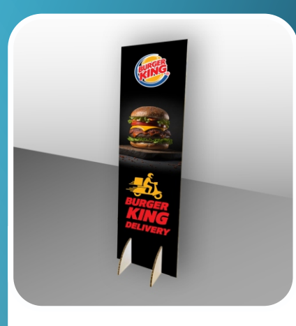
Floor display in reboard