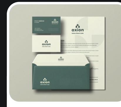
Corporate identity (business cards, letterhead, etc.)